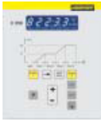
Controller C 250